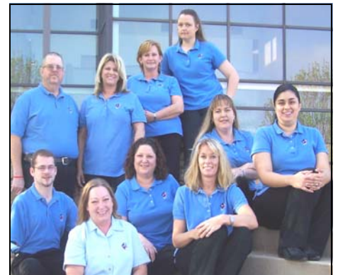
First Telecommunicator Academy

Kyle now receives 9-1-1 calls generated from within their city limits directly; ( see NEW PSAP, p. 4 )