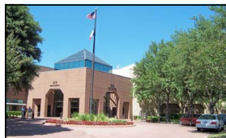
Side entrance of CAPCOG's new offices.

Shelter - $60,000; Center for Child Protection - $75,000; and Children's Advocacy Center Serving Bastrop, Lee & Fayette Counties - $80,000.