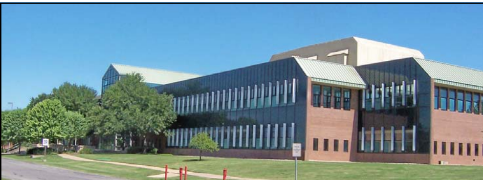
CAPCOG's new offices will be in the Bergstrom Technology Center located at 6800 Bureson Road. The move is planned for late October. (See back page for additional picture.)

The new facility will be built out to include a new law enforcement training facility as well as a back-up 9-1-1 PSAP. Additional benefits include more meeting space, improved technology, and an easily accessible location.