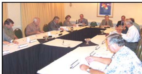
The CAPCOG Executive Committee during last year's General Assembly meeting.

ship for the 2007 Executive Committee. The General Assembly is composed of representatives from each member organization; it votes each December on an Executive Committee that will oversee operations of the COG's business.