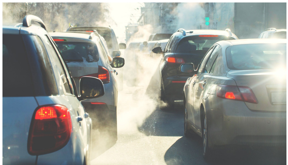
Figure 3. Image of Vehicles Idling

On March 20, 2024, the Environmental Protection Agency (EPA) announced final national pollution standards for passenger cars, light-duty trucks, and medium-duty vehicles for model years 2027 through 2032 and beyond. EPA finds that these standards will avoid more than 7 billion tons of carbon emissions and provide nearly $100 billion of annual net benefits to society, including $13 billion of annual public health benefits due to improved air quality, and $62 billion in reduced annual fuel costs, and maintenance and repair costs for drivers. You can read the full press release here .