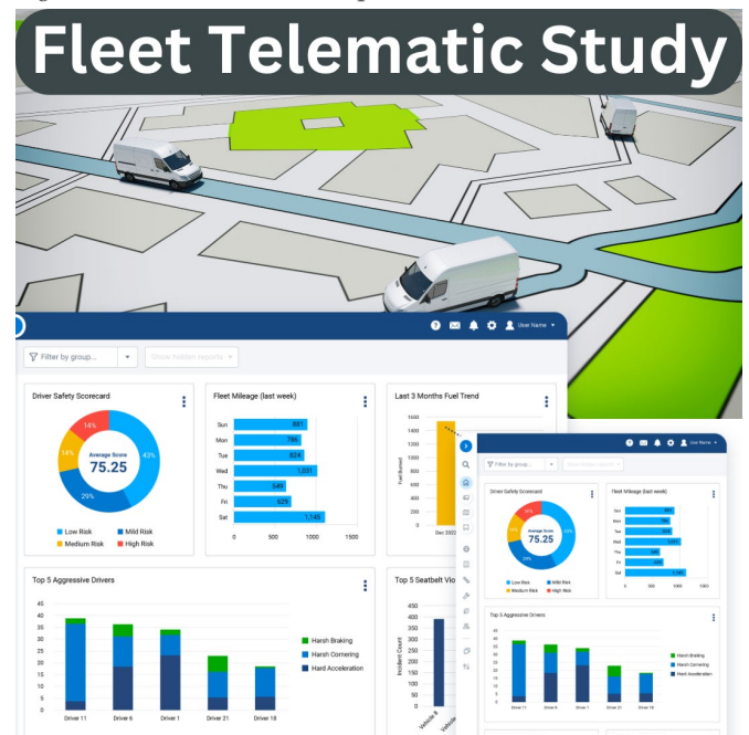
Figure 1. Fleet Telematic Graphic

In addition to providing use with information to better understand fleet emissions, these devices could also provide your organization with the following data points: