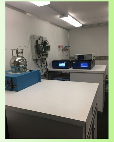
Entech 1800 cannister sampler, Teledyne SO<sub>2</sub> and H<sub>2</sub>S analyzers and associated instruments