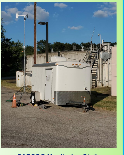
CAPCOG Monitoring Station

WESTON proposes keeping the same terms in the 2022 contract that were provided in the 2019 contract. As outlined in the CAPCOG RFP, WESTON proposes CAPCOG provide a $300 per month contingency